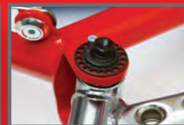
Adjustable caster/camber eccentrics