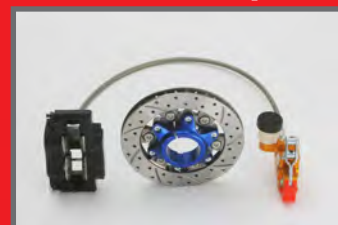
Self-adjusting brakes with floating vented rotor