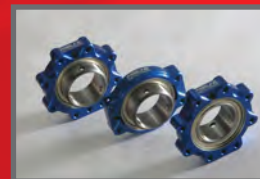
Re-designed bearing cassettes